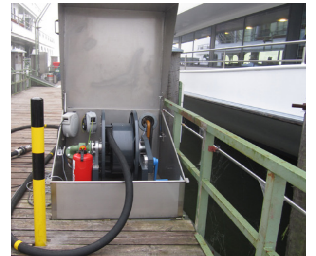
Protecting people and environment, preventing disasters.