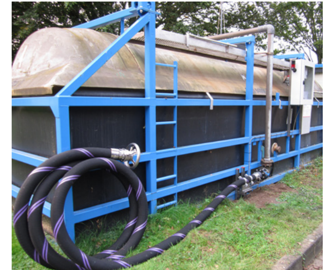
Transfer of sensitive media at any place.