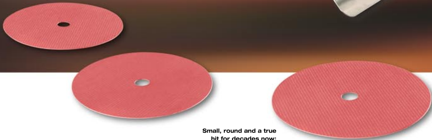
Small, round and a true hit for decades now: flat diaphragms from ContiTech.

In our day-to-day lives we take many things for granted simply because they function so well. We place blind faith in the technology involved, rarely giving it a second thought or even trying to form a picture of the complex behind-the-scenes control sequences. Electrical appliances, for example, automatically shut off when something goes wrong, preventing worse from happening. Safety belts respond to changes in speed and unobtrusively hinder the driver from lunging forward in the case of panic braking.