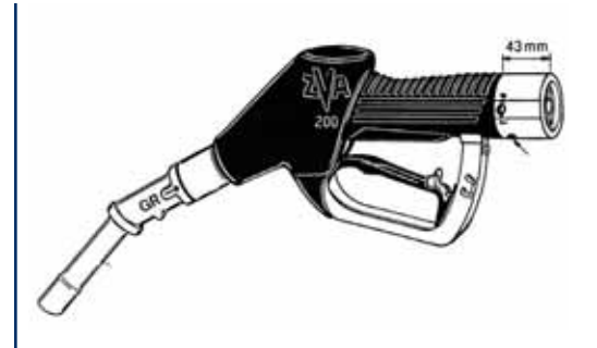
\operatorname{ZVA} 200 GRVP nozzle with integrated vapour/volume control on the nozzle

The countdown to Stage II implementation is moving relentlessly on. In the trade journals contributors are emphasising that qualifying forecourts will have to be complete by the 1st of January 2010. It's obviously important that the equipment you are being offered or intending to install is suitable for use. The simplest way to is to ask to see the appropriate system approvals for Stage II. Alternatively you could visit other European countries where Stage II equipment is installed and in large scale use and see for yourself. Normally the dispenser