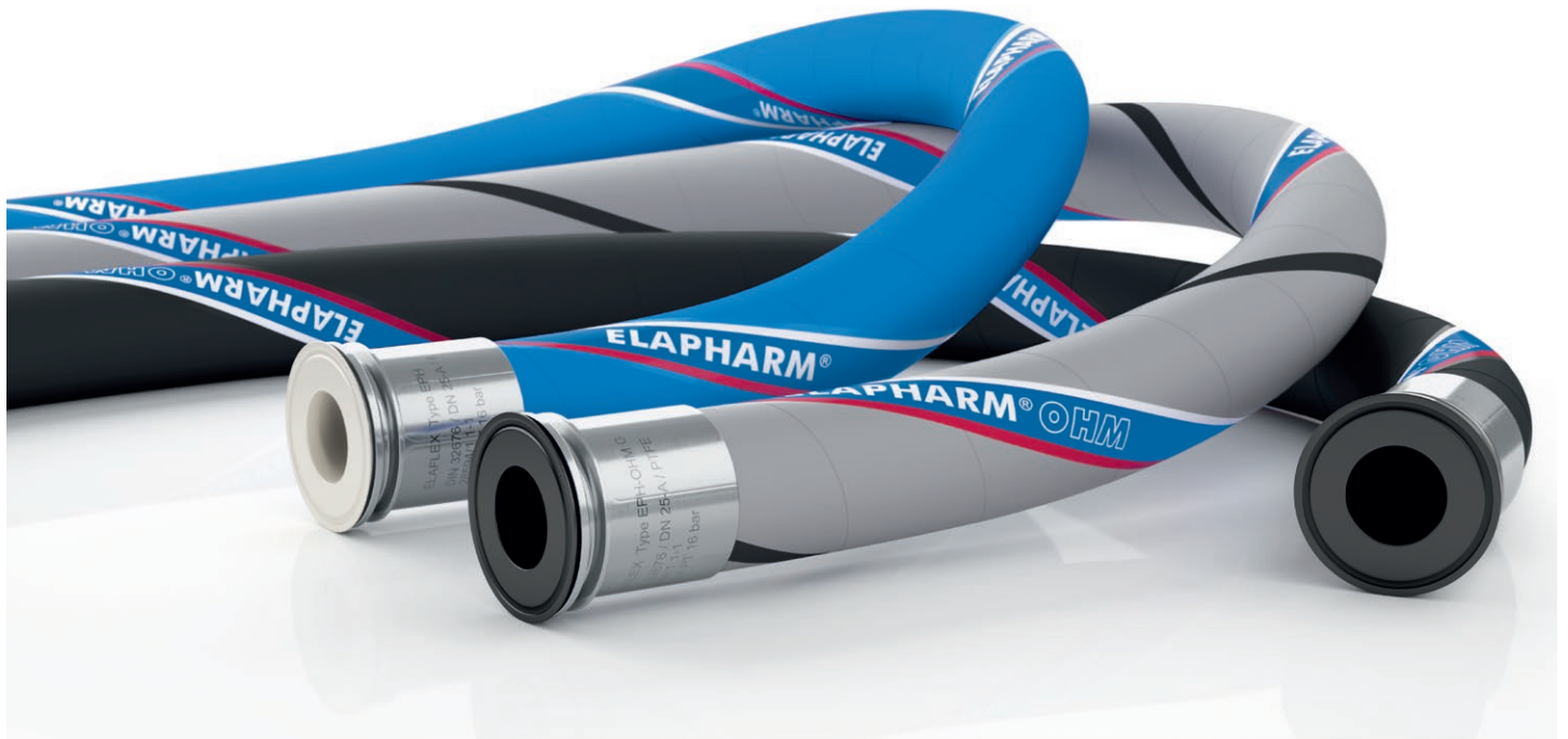
ELAPHARM hose assemblies in three versions: with black or light grey cover (to DIN 26055-3 Type B, electrically conductive) and blue cover (to DIN 26055-3 Type A, electrically isolating)

During a modernisation project of its production facilities, a pharmaceutical manufacturer looked for new solutions for its pharma hose assemblies. Compared to existing hoses, longer service life, increased mechanical stability and easier cleaning were required. After extensive testing, the decision was made in favour of the new ELAPHARM®, developed by Elaflex.