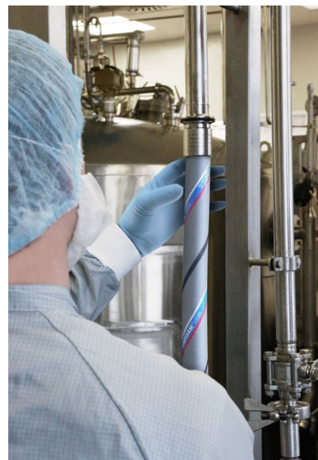
BERLIN-CHEMIE: operator with the new, electrically conductive ELAPHARM with grey cover

The product has also been accepted for use in the BERLIN-CHEMIE manufacturing plant. Since May 2013 the electrically isolating Type EPH with blue cover and white PTFE liner has been in use. "We particularly value the highest pos-