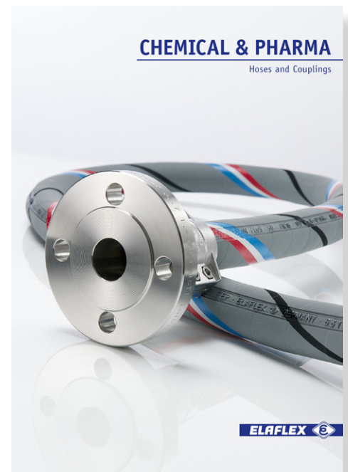
New brochure "Chemical & Pharma"