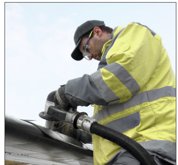
ZVF 50 on duty at airport