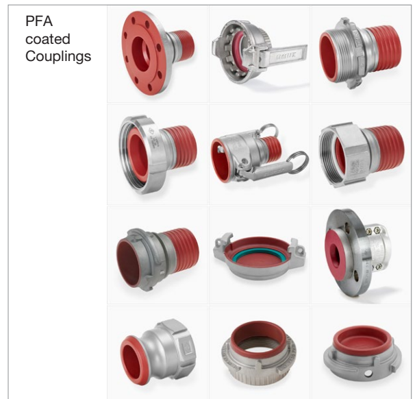
PFA coated Couplings

Opening: pull eyelet to unlock. Closing: automatic lever lock