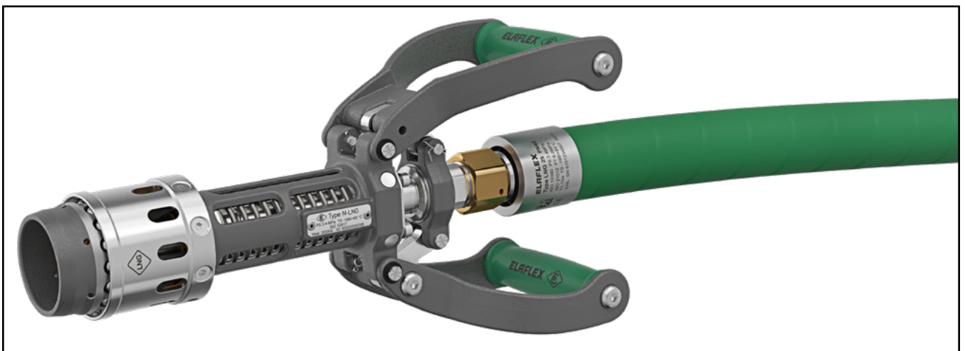
N-LNG nozzle – core component of the ELAFLEX LNG refuelling system for trucks