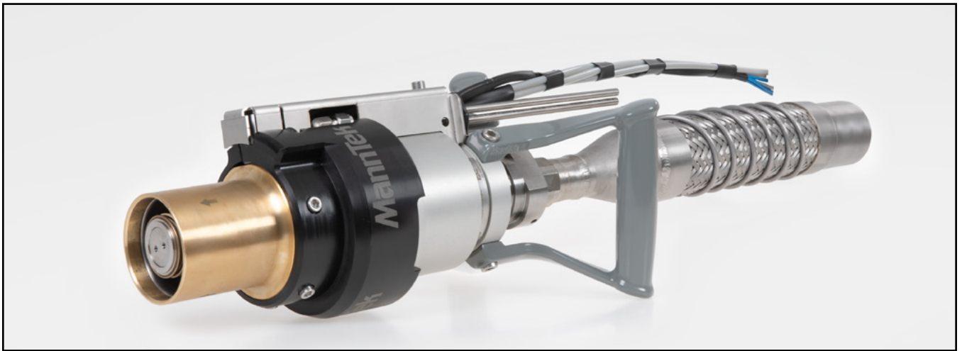
N-LH2-P – semi-automatic, pneumatic nozzle from MannTek for refuelling trucks with cryogenic hydrogen (LH2)