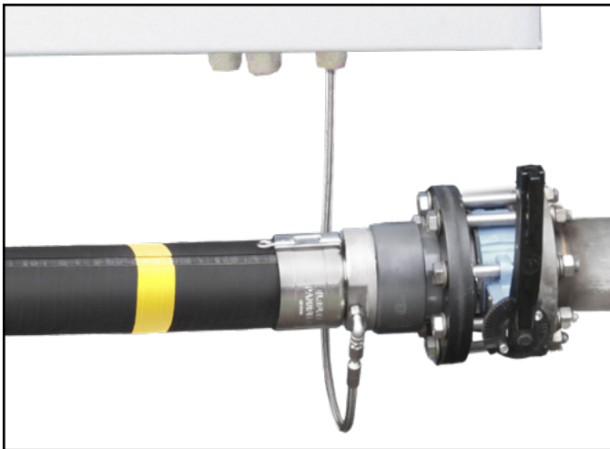
Double-walled hose solution ELAFLEX DualSafe with leak prevention technology from SGB