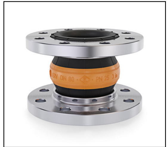
Rubber expansion joints (ERV) for LPG and DME von ELAFLEX