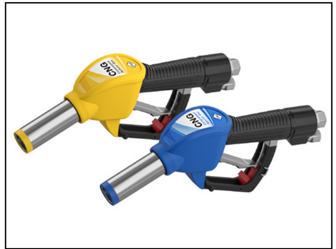
N-CNG nozzle for 250 bar/3,600 psi (US standard, yellow) and 207 bar/3,000 psi (EU standard, blue) from ELAFLEX