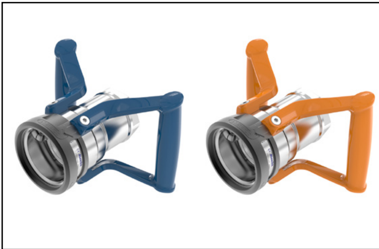
Dry disconnect couplings and breakaway couplings for liquid (DDC 2.0) and gaseous (DGC 2.0) media from MannTek