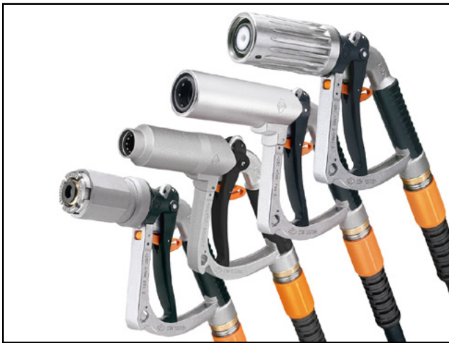
Hose assemblies, breakaway couplings, ZVG 2 LPG nozzles for DISH, K, EURO and ACME connections from ELAFLEX