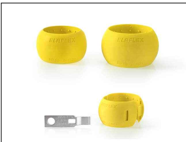
BD hose beads for aircraft refuelling hoses and the specific use on airfields, available in DN 63, 50 and 38, can be easily assembled and disassembled.