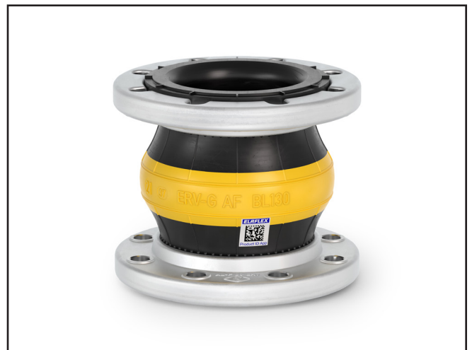
ERV-G AF rubber expansion joints for all aviation fuels in sizes DN 50, 80, 100, 150.