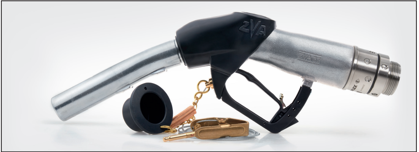
The ZVA 32 AF is a versatile aviation nozzle designed for overwing refuelling, providing up to 200 l/min fuel with automatic shut-off. All parts in contact with fuel are free of non-ferrous metals.