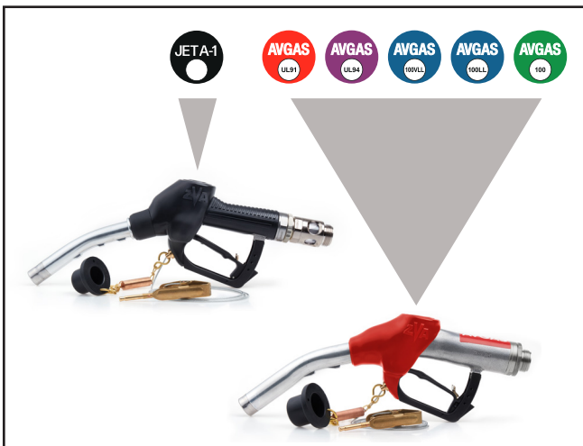
Robust, weather- and fuel-resistant badges to prevent misfuelling for JET-A1 and AVGAS in its subsorts.