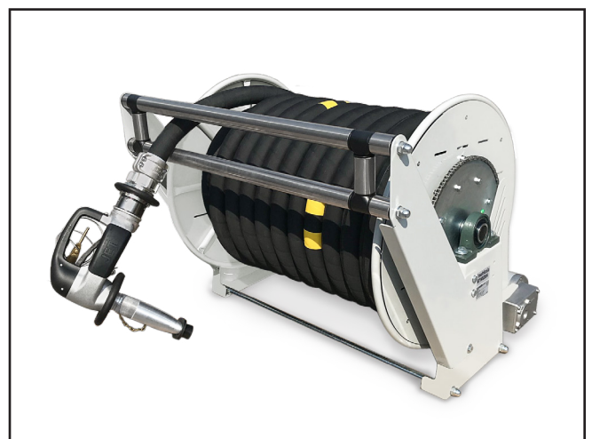
Hose reels and trolleys, custom-made to customer requirements, in various materials, sizes and colours.